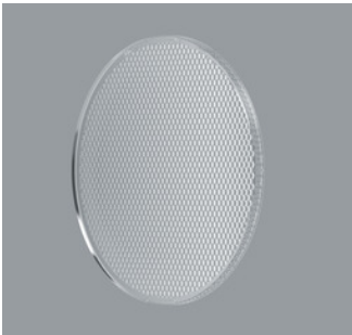
70848.000 Spherolit lens flood made of optical polymer. Replacement without tools.