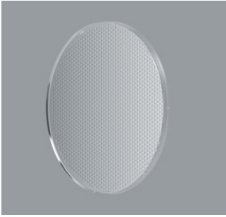
70863.000 Spherolit lens spot made of optical polymer. Replacement without tools.