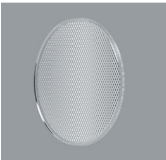
70849.000 Spherolit lens wide flood made of optical polymer. Replacement without tools.