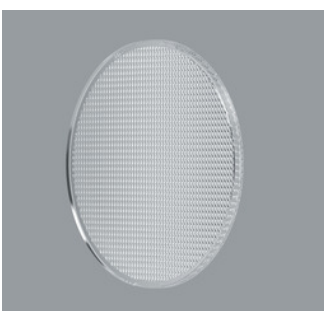
70865.000 Spherolit lens wallwash made of optical polymer. Replacement without tools.