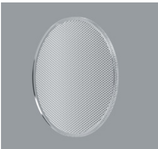
73998.000 Spherolit lens extra wide flood made of optical polymer. Replacement without tools.