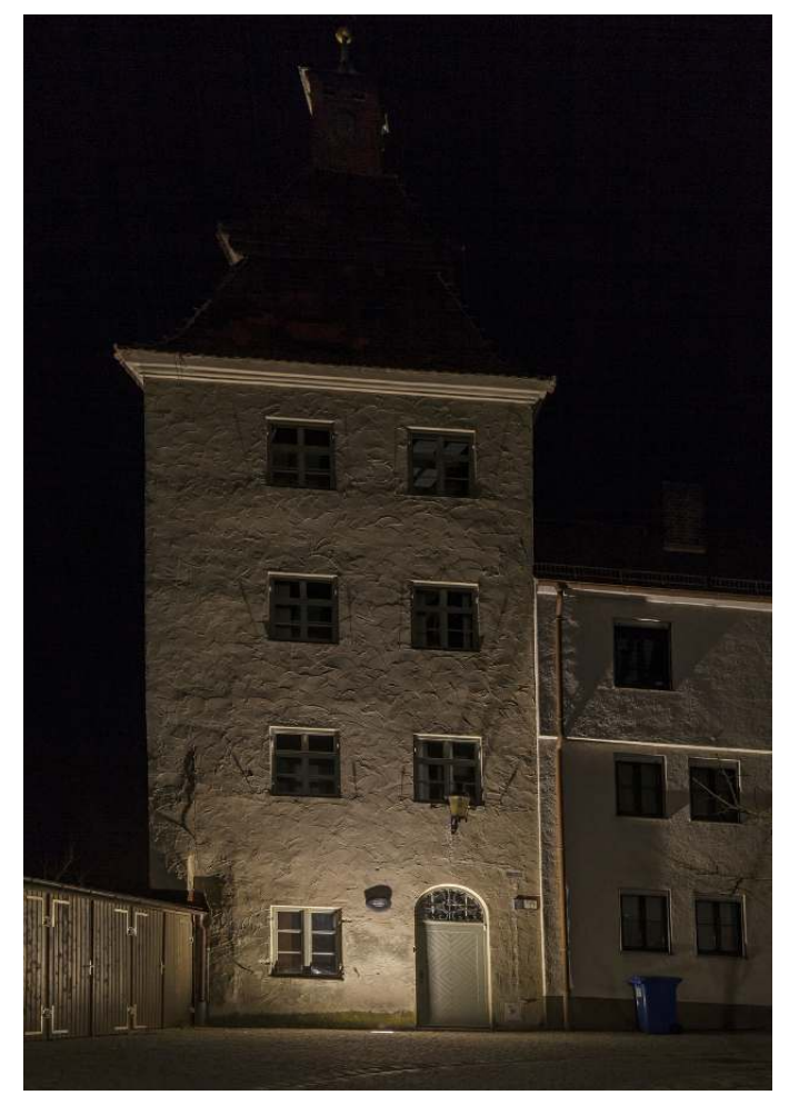
Ursula Tower, Günzburg. Light-ing design and E-planning: Con-planing GmbH, Ulm.

The optimal wall offset and luminaire spacing for each product are indicated in the wallwasher tables in the catalogue and the product data sheets.