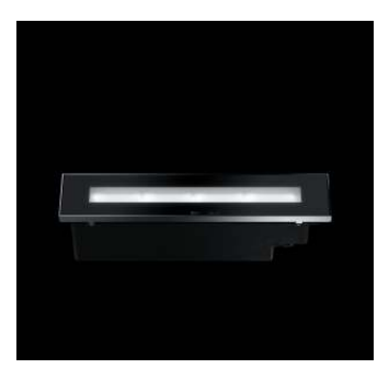
Very high visual comfort ERCO has developed luminaires with special housing designs and highquality optical components specifically for demanding visual tasks to provide enhanced visual comfort.