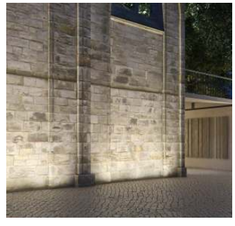
Grazing light wallwashing Grazing light wallwashers need to be positioned close to the wall for ideal effects.