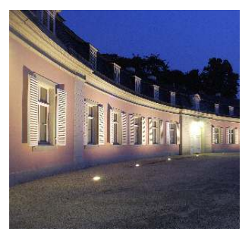
Large luminaire spacing ERCO's efficient photometrics enable selected luminaires to be spaced particularly far apart, thereby minimizing the number of luminaires required.