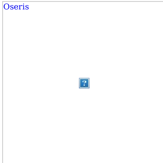
• Oseris Luminaires for track