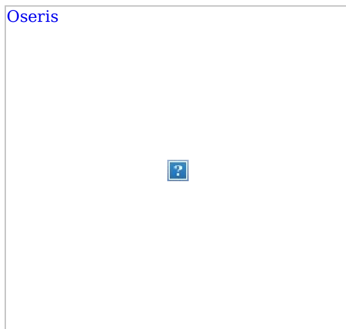
Oseris Luminaires for track